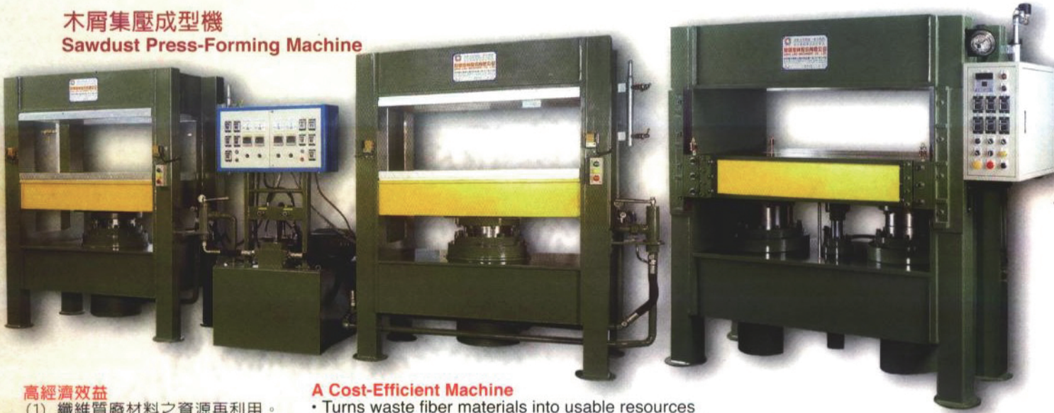
木屑集壓成型機 Sawdust Press-Forming Machine